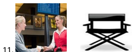
a box office