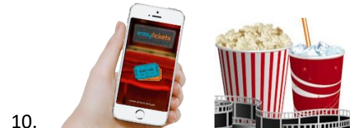
drinks and refreshments